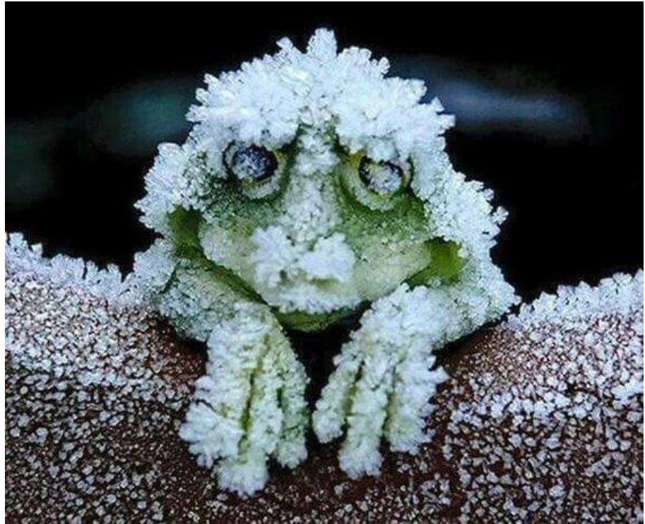
BABY IT'S COLD OUT THERE!